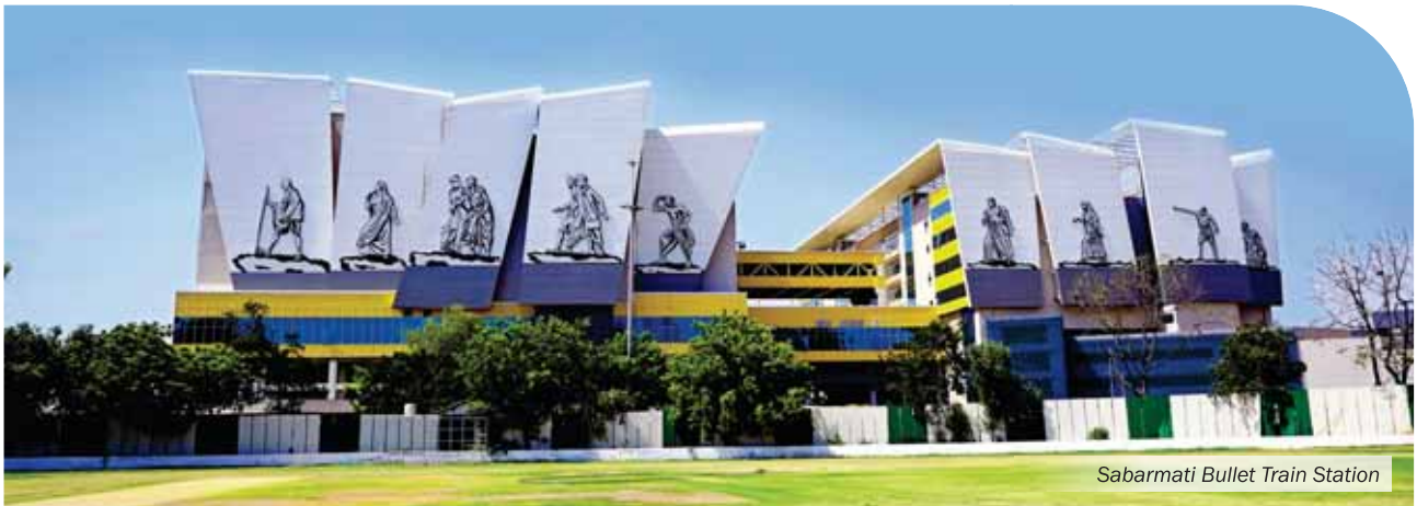
Sabarmati Bullet Train Station

The Minister further stated that international connectivity projects, including links with neighbouring countries such as Bhutan, have also been taken up.