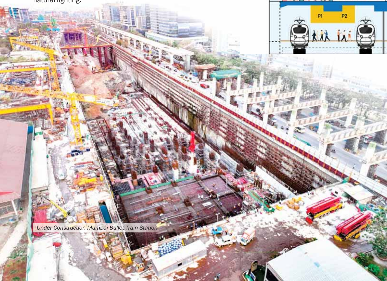
Under Construction Mumbai Bullet Train Station